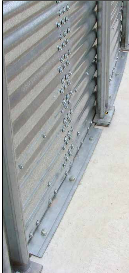
Brock's heavy base angle is available to match bin configurations of two- or three-stiffeners per sidewall body sheet.